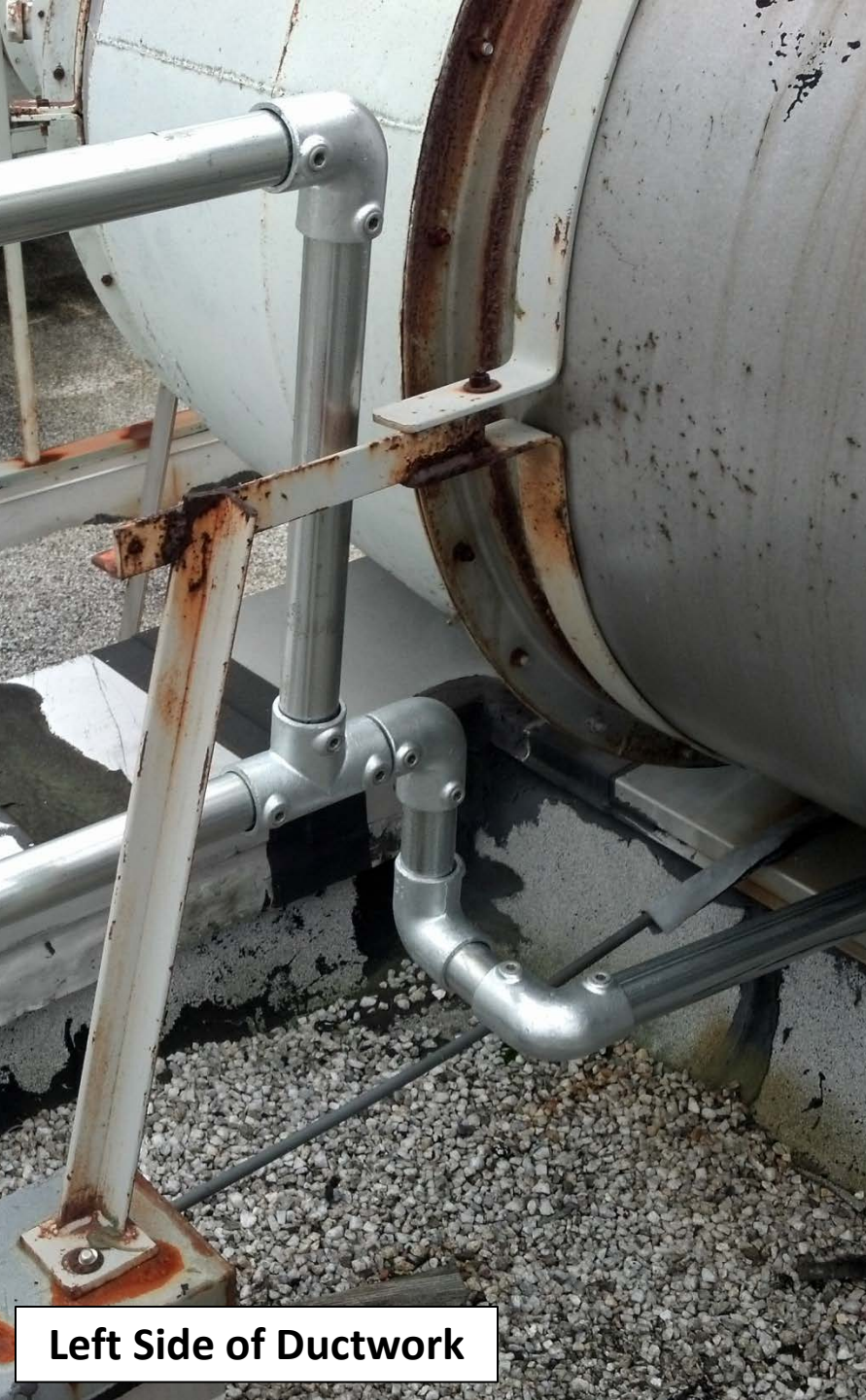
Left Side of Ductwork